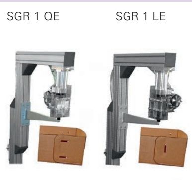
SGR 1 LE