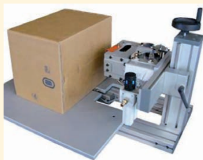
Examples of a carton sealing in various positions (top, bottom, side), ideally for a double corrugated cardboard box