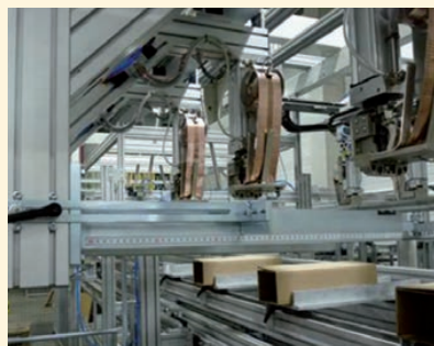
Stapling of PAL-box sleeves