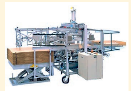
SHA stapling machine: automatic bottom tray and cover tray stapling