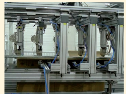
Stapling of sleeves to ready-made PAL-box