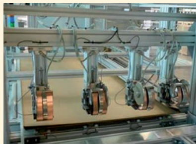
Preparation of cardboard blanks (oversized)